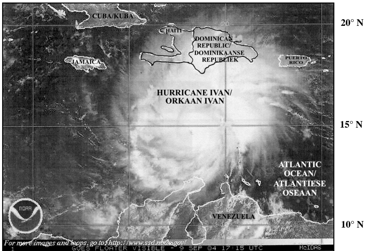
[Satellite photograph of Hurricane Ivan/Satellietfoto van Orkaan Ivan (9 September 2004)]

PHOTOGRAPH 2: A Satellite photograph of Hurricane Ivan: Question 2.1 FOTO 2: 'n Satellietfoto van Orkaan Ivan: Vraag 2.1