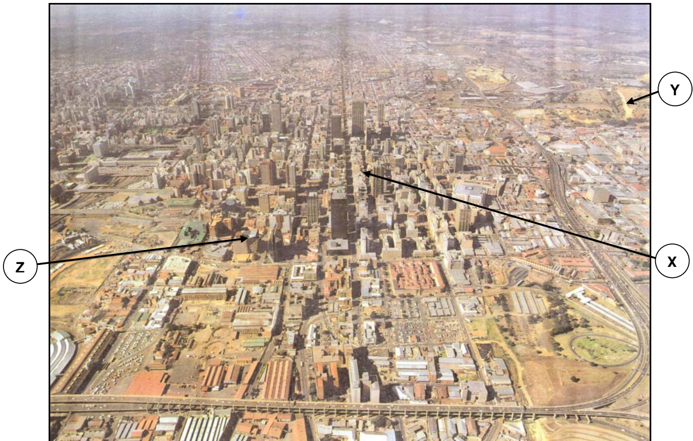
[From/ Uit: Mapwork Made Easy ]

Photograph 2: Question 1.2.3 – Johannesburg Foto 2: Vraag 1.2.3 – Johannesburg