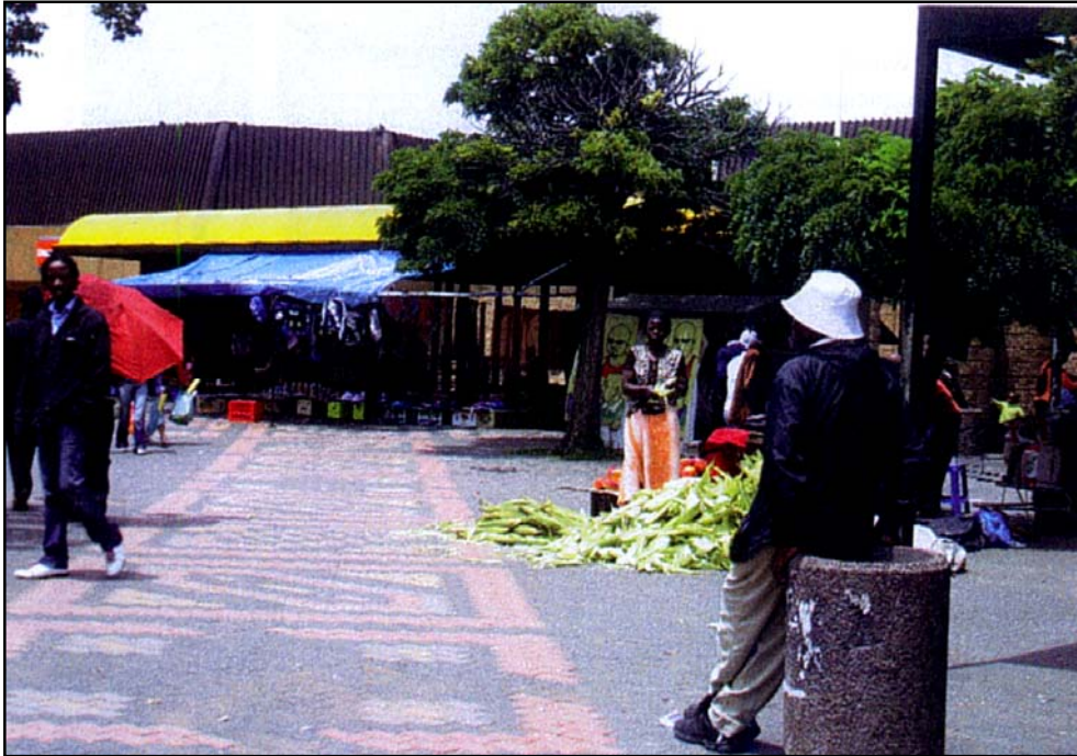
[ Urban Green File , Photographer: Engela Meyer, February 2007]