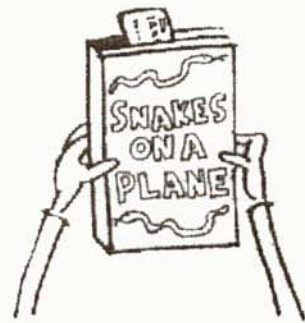
Use it as a bookmark.