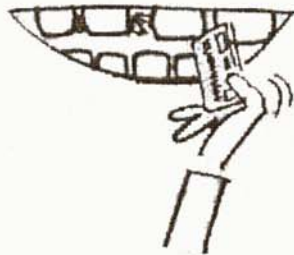
Pick your teeth.