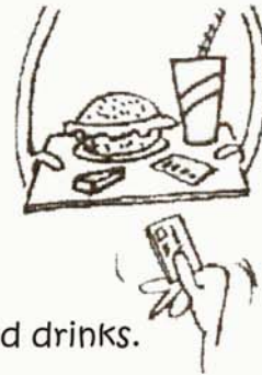
Buy your snacks and drinks.